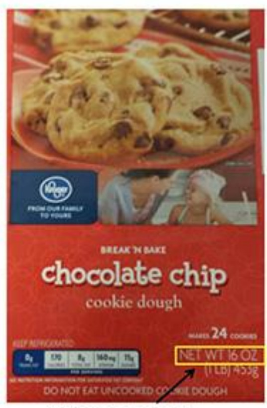
16.0 ounce package